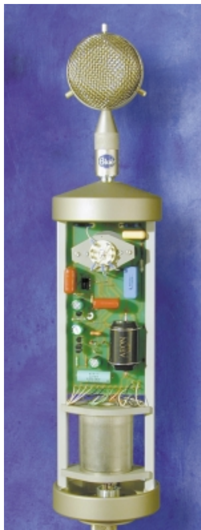
Inside the Bottle

SAFETY NOTE: Do not attach a capsule or the multi-pin Champagne cable to The Bottle until it has first been attached to a stand. Once the microphone body is secure, connect the Champagne cable to The Bottle and the 9610 power supply, and then turn on the 9610 to start the warm-up process. At the end of a session, be sure to turn off the 9610 power supply before disconnecting the Champagne cable.